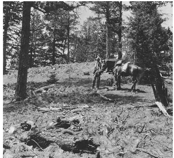
Fig. 2 Lopped and scattered tree branches lay on the ground after a settlement-era timber harvest near the managed study site.

This area has experienced a considerable amount of human activity since it was settled by European-Americans in the mid to late 1800s, with the heaviest use coming from settlement-era loggers and ranchers. Widespread, unregulated logging occurred from the 1880s to the 1900s when several local lumber mills were established, and nearly all merchantable timber was removed (Fig. 2; DeLay 1989; Jack 1900). Unregulated grazing by domestic cattle also occurred from the 1880s to the 1900s, and many areas were severely overgrazed (DeLay 1989; Gary and Currie 1977; Jack 1900). Logging and grazing largely ceased in 1906 when the Pike National Forest was established, and since then only a limited amount of logging and grazing has occurred. Prospectors flooded the area in the early 1890s when rumors of gold discovery first surfaced, but precious metals were never found and mining activity ceased within the decade (DeLay 1989). In the 1930s, the Civilian Conservation Corps planted P. ponderosa trees in select locations to help reforest heavily logged and