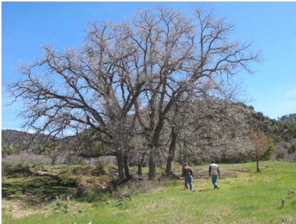
Some "scrub oak" (Quercus gambelii) found in southern Utah!

New videos explain the National Cohesive Strategy: