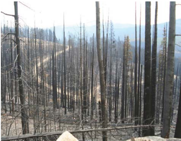
Snag stands produced by high-severity wildfire present high potential for future surface fuel loadings. Credit: R. Harrod.

People engaged in the debate over post-fire logging tend to divide into two camps: those who favor timber utilization and those who favor letting natural processes take their course. Those who favor harvesting snags (fire-killed standing trees) after fire argue that it can generate income for the community and may help reduce the risk of insect and/or disease outbreaks. Those who favor natural processes complain that post-fire logging may increase the fire hazard in the short term by increasing surface fuels. Furthermore, they say that post-fire logging can harm soil properties; increase runoff and erosion, thereby harming water quality; degrade wildlife habitat; slow future forest growth; and aid the spread of invasive and/or exotic species. Focusing instead on fuels management may be a valid third perspective.