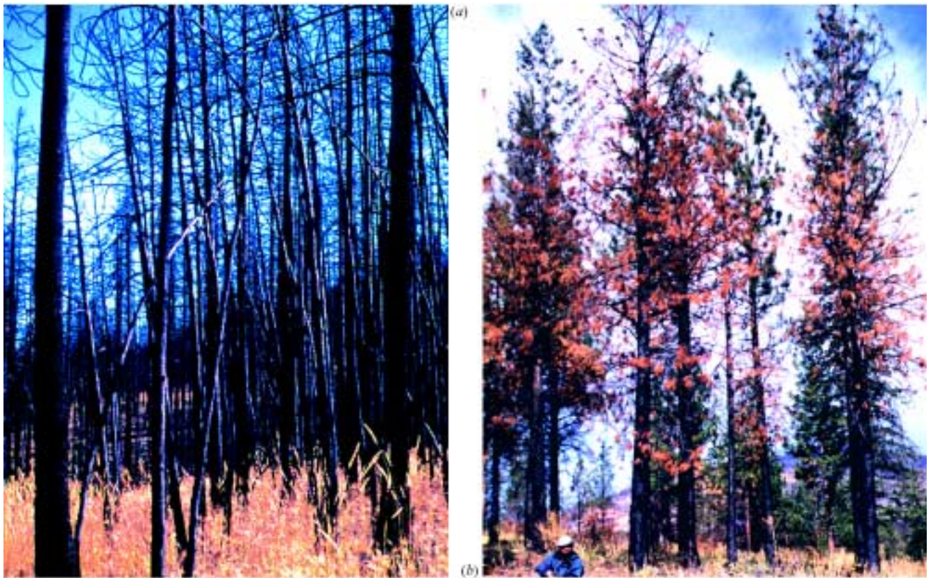
Fig. 2. Untreated (a) and treated (b) at the Tye Fire site at adjacent locations.