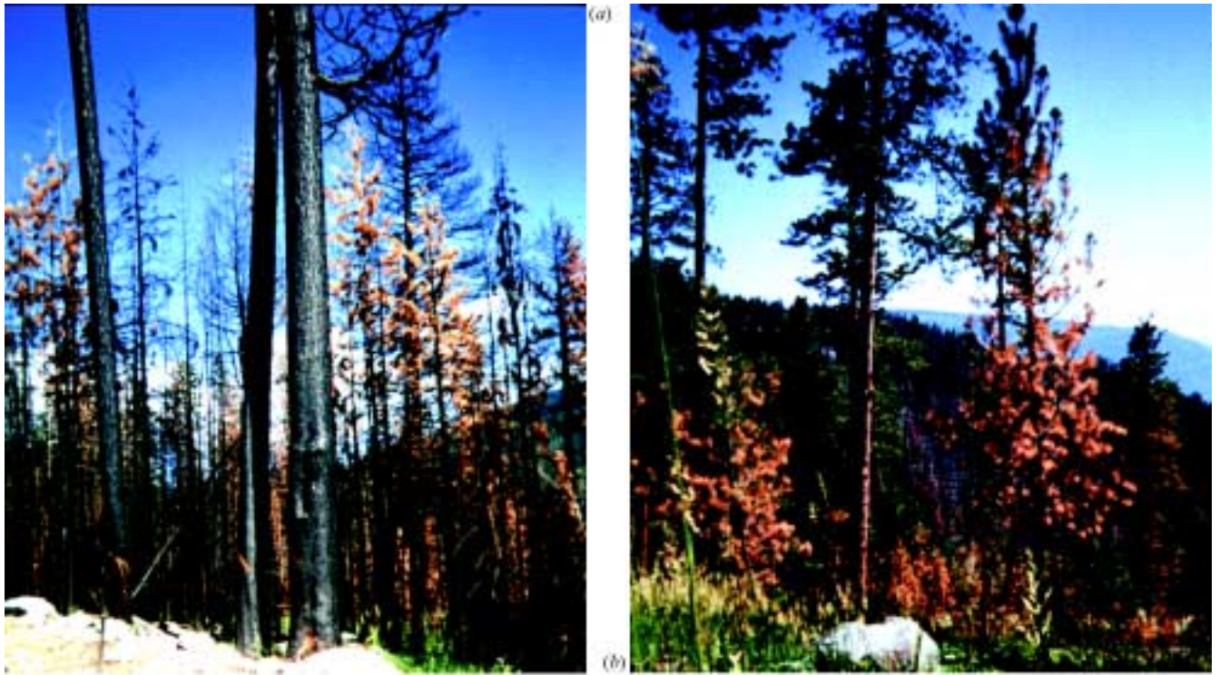
Fig. 1. Untreated (a) and treated (b) stands at the Webb Fire site at adjacent locations.