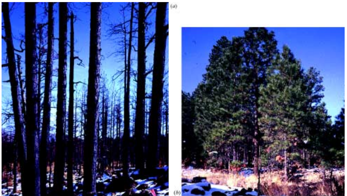
Fig. 4. Untreated (a) and treated (b) stands at the Hochderffer Fire site at adjacent locations. Multiple stems with full crowns in the foreground of the treated photo mask the larger diameter trees in this plot.